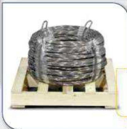
Coils on pallets